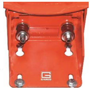
Dual Return Springs