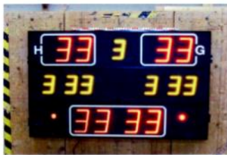
Photo 1 Overall view, Test side Indoor Multi Sport Scoreboard "Model MSA 210.300"