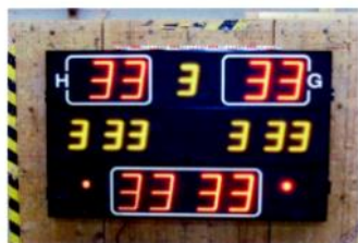
Photo 1 Overall view, Test side Indoor Multi Sport Scoreboard "Model MSA 210.300"