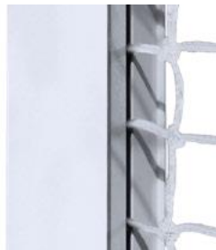
Unique In-profile Net Attachment

System: Futsal Product Code: ALMG Related Products: Aluline Club Football Goals Aluline International Goals