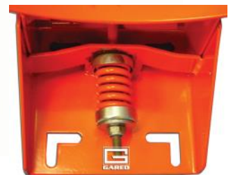
Single Return Spring