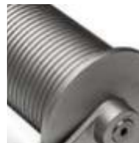
Machine Grooved Cable Drum